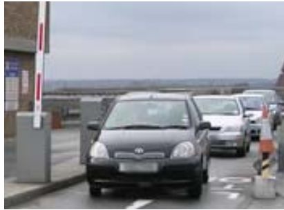
Drivers at this car park experienced shocks mainly during sunny weather

will naturally generate static electricity at a rate increasing with their speed. Cars are normally grounded effectively through their tyres, which are slightly conductive due to their carbon content. Providing the ground surface is sufficiently conductive charge is dissipated within seconds after the car is stopped. Some modern surfaces, however, are highly insulating and do not allow the charge on the car to dissipate—the car can remain at high voltage for some time. When the driver leans to the ticket machine the entire charge held on the car can dis-